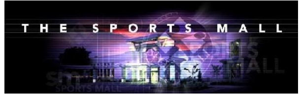
Wasatch Beach is at THE SPORTS MALL

Register before 5:00 P.M. on Friday, May 13 using paypal: http://www.sportsmallgroup.com/id62.html . Or, drop off your registration and payment at The Sports Mall. Register at the event - on Saturday, May 14: Bring your registration and payment to the event.